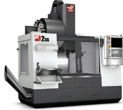
Vertical Machining Centers