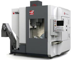
Universal Machining Center