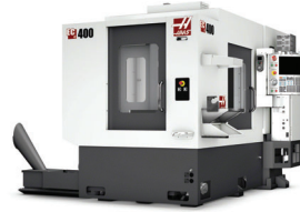
Horizontal Machining Centers